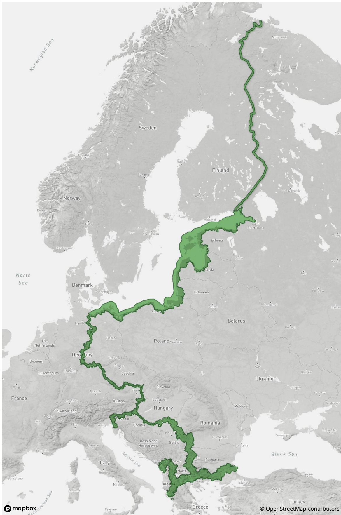
Figure 1: Indicative spatial reference area of the European Green Belt , defined by the European Green Belt Association (EGBA). The northern part of the reference area (Fennoscandia) is under preparation. For the BESTbelt project, the area is defined as 100 kilometres (km) of the border for Norway and Finland, 150 km of the border for Russia and 5 km on the coastal water.